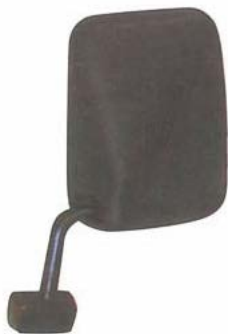
TH-1785 DELICA L300