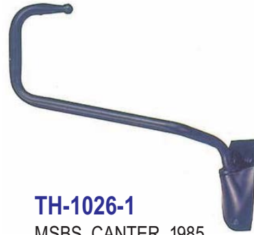
TH-1026-1 MSBS CANTER 1985 W/O ANGLE MIRROR ARM