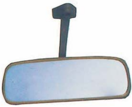
TH-1238 DELICA L300