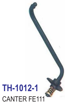
TH-1012-1 CANTER FE111