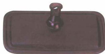
TH-1697 CANTER, ARABIAN NEW TYPE SIZE: 330 x 195m/m EUROPEAN TRUCK, UNIVERSAL TYPE