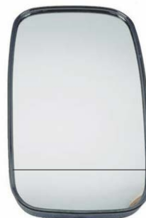
TH-1656 NEW CANTER 1999 ASPHERICAL GLASS