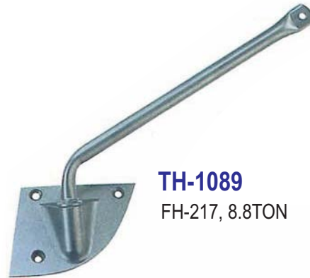
TH-1089 FH-217, 8.8TON