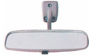
TH-1297 NEW PAJERO, FREECA, MONTERO, LANCER 1993 (DAY & NIGHT GLASS)