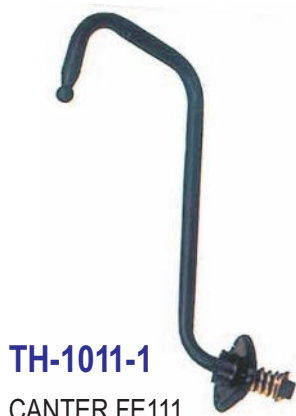
TH-1011-1 CANTER FE111 W/OUT ANGLE MIRROR ARM