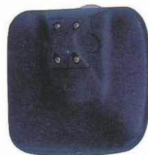
TH-1663 FK, FV, FUSO-330