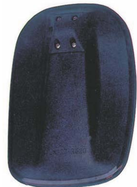
TH-1662 FK, FV, FUSO-330