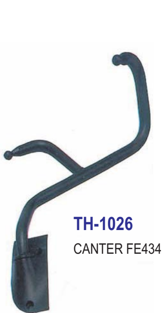
TH-1026 CANTER FE434