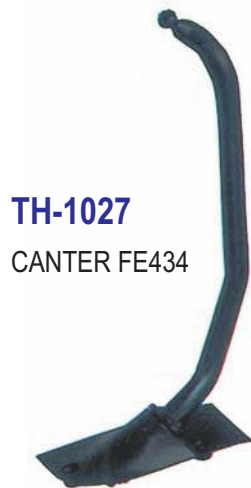
TH-1027 CANTER FE434