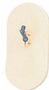
TH-1630 CANTER 1980