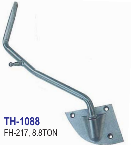
TH-1088 FH-217, 8.8TON