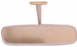
TH-1263 COLT, DELICA