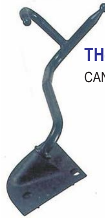
TH-1086 CANTER FH-217, 3.5TON