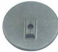
TH-1778 ROSA & CANTER ANGLE MIRROR : 5-3/4"