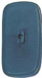
TH-1629B CANTER FE111