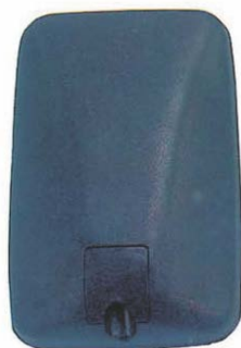
TH-1657 NEW CANTER & ROSA SIZE: 7" X 11"