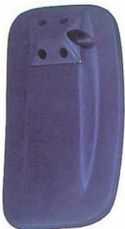
TH-1620 FK415, FUSO-320