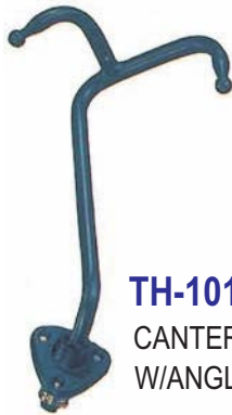
TH-1011 CANTER FE111 W/ANGLE MIRROR ARM