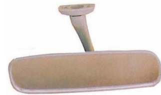
TH-1271 MINI CAB L100, COLT DELICA 1979