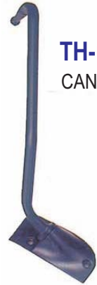
TH-1027-1 CANTER 1985