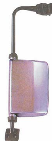
TH-710 PAJERO MONTERO