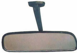
TH-1255 CANTER FE111