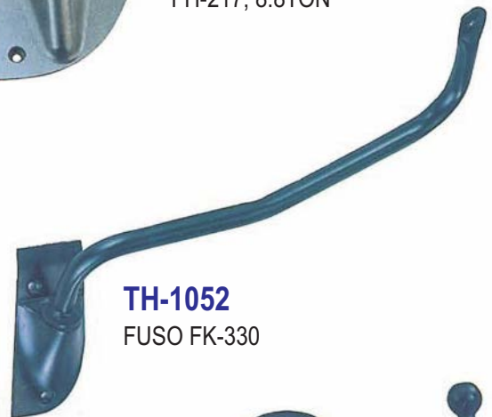
TH-1052 FUSO FK-330