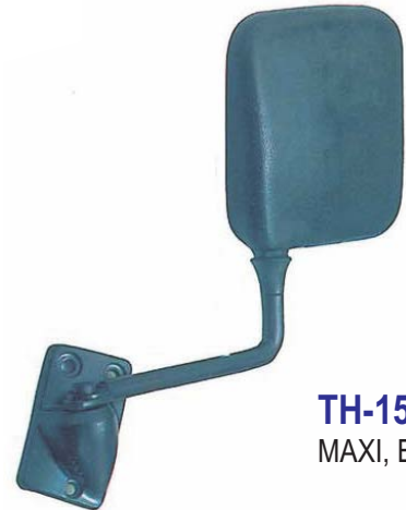
TH-1579 MAXI, BANGO