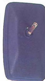
TH-1621 TRUCK T2000 / 3500 / 2600 / 4100