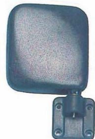
TH-1578 MAXI, BANGO