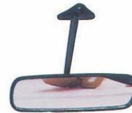
TH-1210 B-1600, PICK-UP