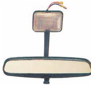
TH-1201 MAXI (ECONOVAN), W/LAMP (DAY & NIGHT GLASS)