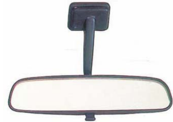
TH-1228 MZ 626 / 929 FORD TELSTAR & TX5 (DAY & NIGHT GLASS)