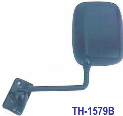
TH-1579B MAXI, BIG HEAD