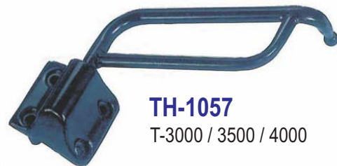
TH-1057 T-3000 / 3500 / 4000