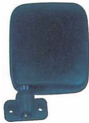
TH-1571 BANGO MAXI 1985