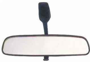
TH-1225 MZ 323, 1984 (DAY & NIGHT GLASS)