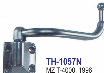
TH-1057N MZ T-4000, 1996