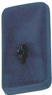
TH-1660 NEW TYPE T4000 / 3500 / 3000