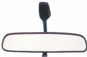
TH-1226 MZ 323 FAMILIA 1982 (DAY & NIGHT GLASS)