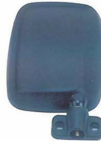
TH-1571B MAXI, BIG HEAD