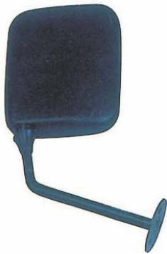
TH-1569 BANGO E1800