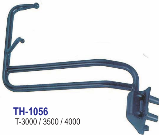
TH-1056 T-3000 / 3500 / 4000